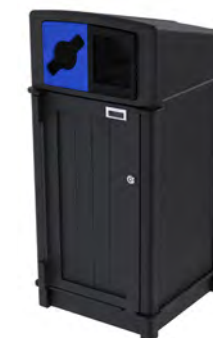
Front Load HD