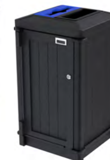
Top Load HD