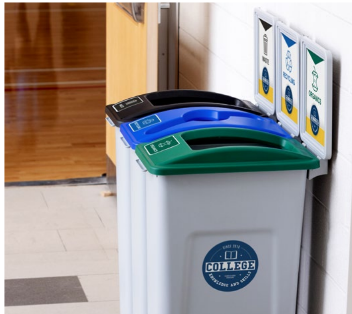
Custom Signs & Labels + Contour Cut Logos