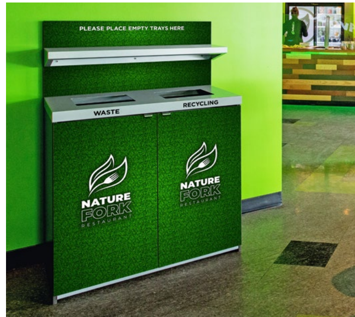
Custom Full Branded Body Wrap