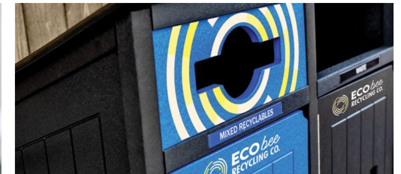
Custom Die-Cut Vinyl Labels