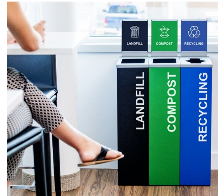
Custom Die-Cut Lettering + Stock Sign Frame Signs

Being green just got more colorful. This modular container is perfectly vivid in color and aesthetically pleasing in any setting. Easily add or change streams at any time with multiple lid, color, capacity, and shape options. Take advantage of its endless opportunities for customization and add features such as castors and sign frames to create a superior recycling program that every organization deserves.