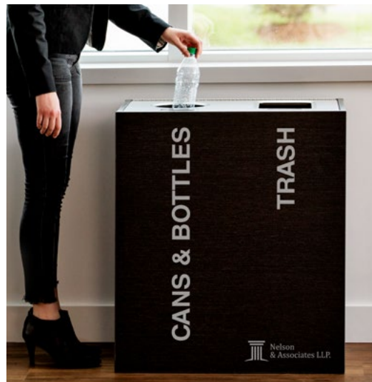
Custom Die-Cut Lettering & Logo

For over five years the Aristata® Series has brought style and sophistication to recycling & waste programs across a multitude of industries. Each container is meticulously crafted to be on-trend with today's modern interiors with multiple stunning finishes that blend seamlessly into any space. With a variety of customization options and multiple streams in one single container, achieve outstanding diversion rates while maintaining an upscale aesthetic.