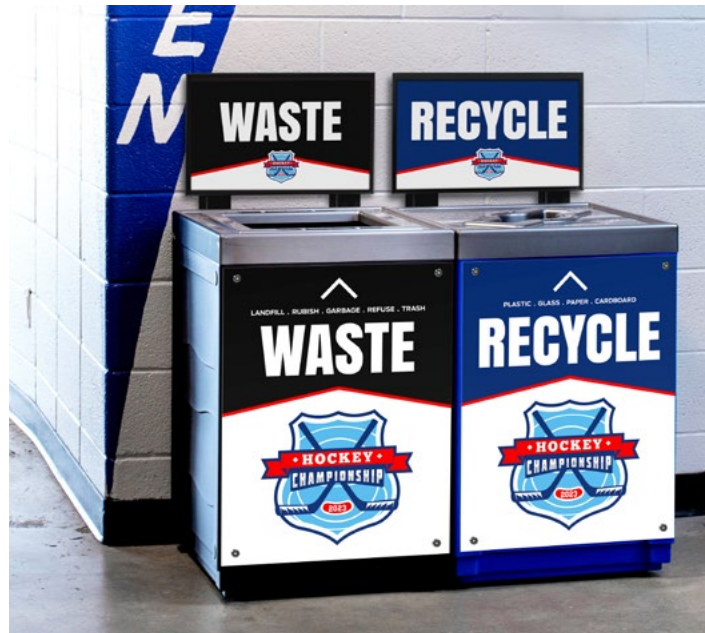
Custom Body Signs + Custom Sign Frame Signs