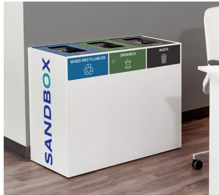
Die-Cut Logos + Custom Body Labels