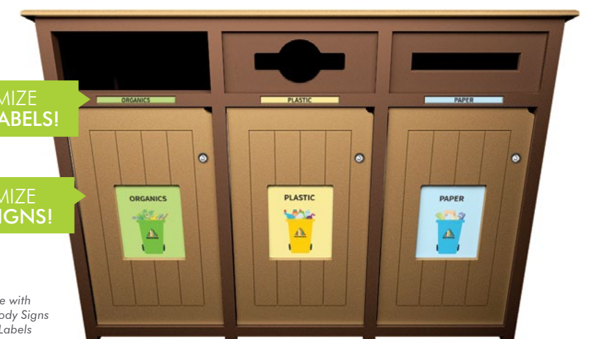
Aura Triple with Custom Body Signs and Jelly Labels