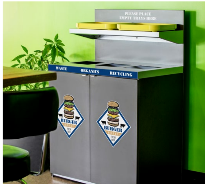
Contour Cut Logos + Custom Labels

Upgrade your recycling & waste program with a design that is compatible with your industry's needs. The Sessanta is built with practicality in mind and offers a sleek design on a budget without compromising quality. Adding the Sessanta to your restaurant or food court will maximize your diversion rate while complementing your décor.