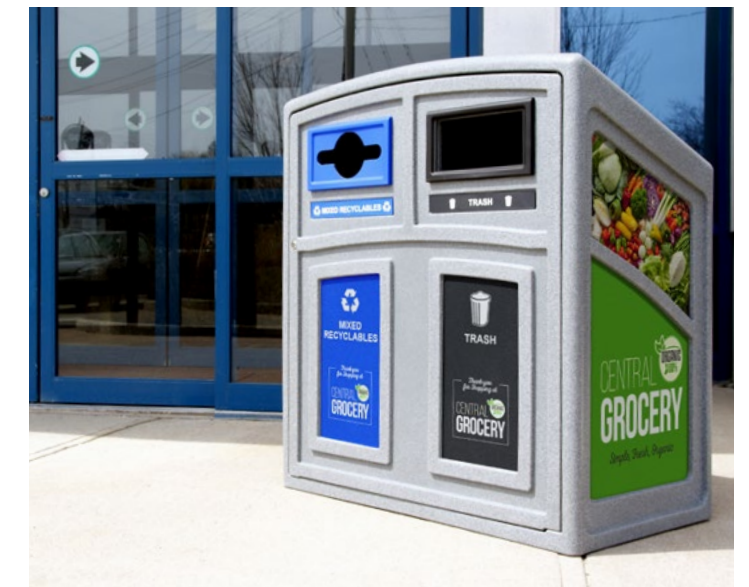
Front + Sides Custom Body Labels