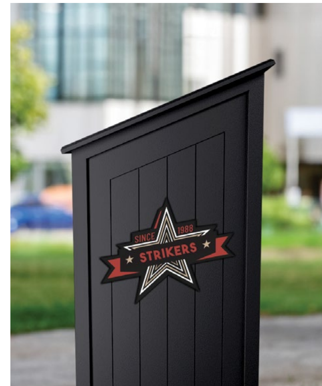
Custom Embossed Side Logo Label

*Please Note: A minimum order quantity is required for custom panel colours