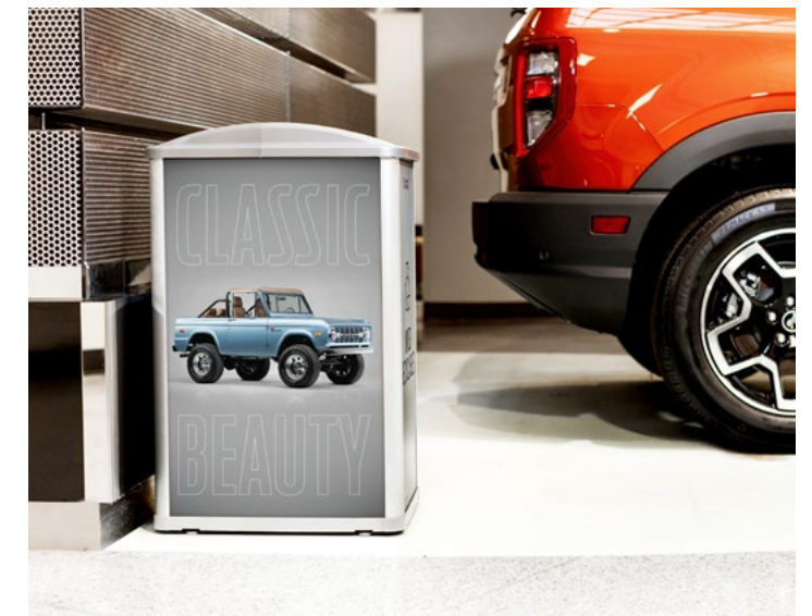
Product Ad Space Custom Body Sign