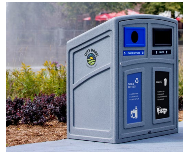
Die-Cut Logos + Custom Front Body Labels

Ideal for high-traffic areas, this recycling station offers the best of the best when it comes to function and style. Rotationally molded for added durability, and lockable double-walled front door ensures that servicing this unit is a breeze for years to come. Built-in deflectors ensure a clean sort, preventing cross-contamination, while the angled surface of the unit directs rain water away from the front of the container. The Uptown is fully customizable, allowing you to create a unique unit that speaks directly to your recycling initiatives.