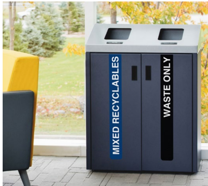
Custom Door Labels

Take your waste bin aesthetic to new heights with the Summit Series. With two sleek lid variations, choose the features that best suit your needs with convenient front door access and a sloped or flat-top design. This sharp, modern container will help maximize the success of your program with multiple streams available in a single central unit, and ample space for labeling on the bin and/or using our customizable sign frame kits!