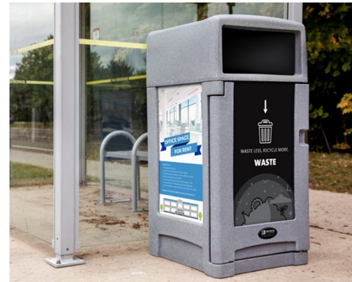
Ad Revenue Custom Body Sign + Stock Waste Body Sign

The Expression™ is the only molded plastic container that effectively prioritizes signage! All four sides have space for customized signage, allowing you to differentiate streams or advertise your business. Made from double-wall plastic with a canopy lid that protects the contents from precipitation, this sturdy container is built to outlast any type of weather. Its simple yet sophisticated appearance is unique and fits perfectly into any outdoor space while adapting to the needs of your program.