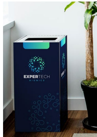
Custom Full Branded Body Wrap