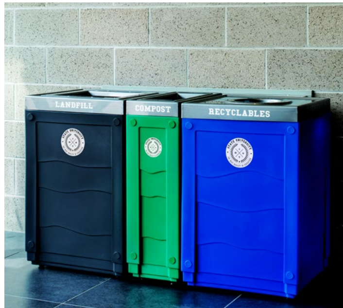
Contour Cut Logos + Custom Die-Cut Lettering

With endless combination options, the Evolve ® Series offers distinguished style for multi-stream collection. Whether used as a stand-alone container or paired together as a standout central collection station, the Evolve ® Series allows you to create a designer quality recycling & waste masterpiece. The Evolve ® Series represents the next step in our commitment to providing high-quality, creative solutions for sustainability.