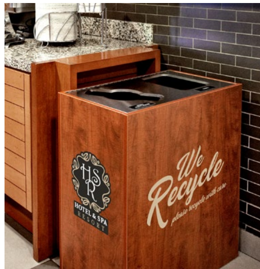
Contour Cut Logo + Custom Die-Cut Lettering