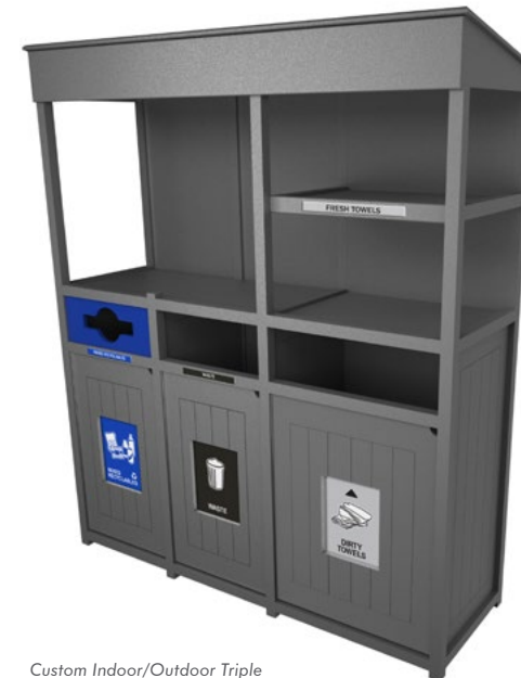
Custom Indoor/Outdoor Triple Container Made from Recycled Plastic Lumber For the Collection and Storage of Pool Towels