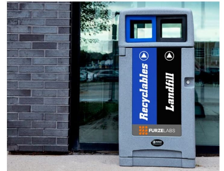
Custom Body Signs