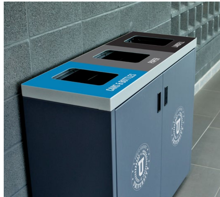
Die-Cut Logos + Custom Lid Wrap