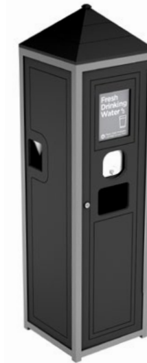
Custom Indoor/Outdoor Drinking Water Unit Made from Recycled Plastic Lumber