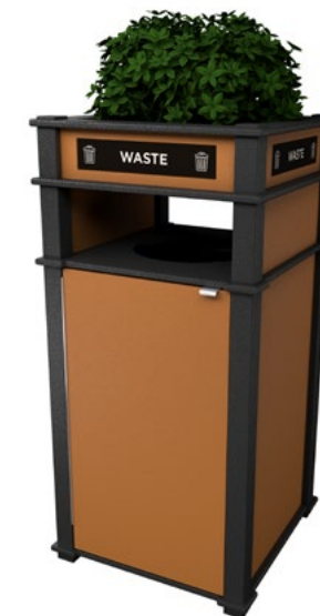
Custom Indoor Single Container Made from Recycled Plastic Lumber Incorporating a Planter Box