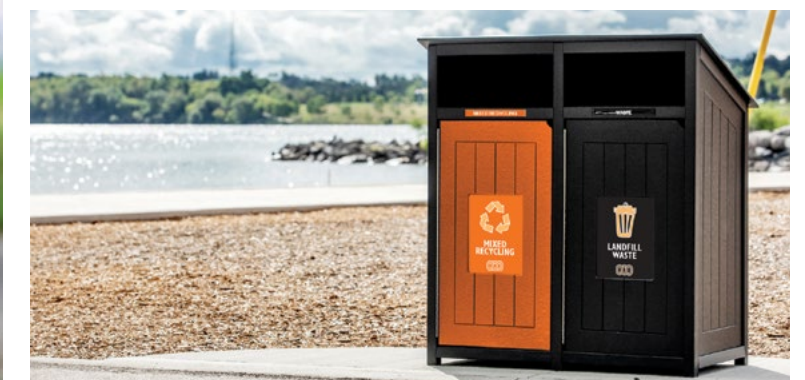
Custom Door Signs, Jelly Labels and Panel Colours*