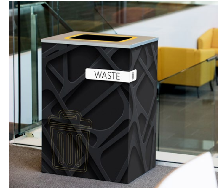
Custom Full Body Wrap + Custom Lid Label