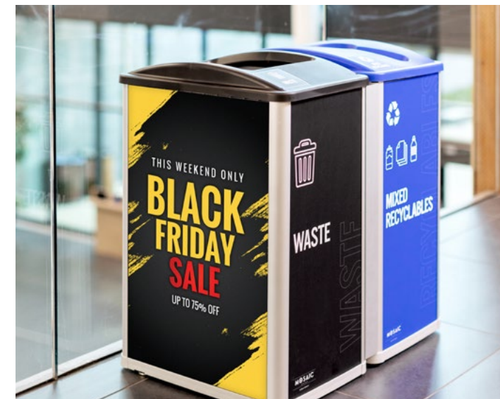
Ad Revenue Custom Body Sign + Available Body Signs

Introducing The Mosaic, an innovative and versatile modular recycling and waste container system! This premium-quality product features a sturdy and durable structure that incorporates customizable signage, making it a perfect fit for businesses and public spaces. Expand your collection capacity seamlessly by incorporating additional containers and utilizing the innovative connector system for secure interlocking.