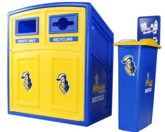
Uptown™ Double in Custom Colors with Custom Body Labels and Waste Watcher® Single with Custom Body Labels