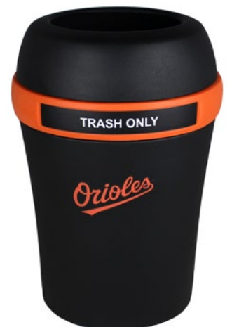
Customized Single Infinite™ Container with Custom Color Ring and Branded Body Labels