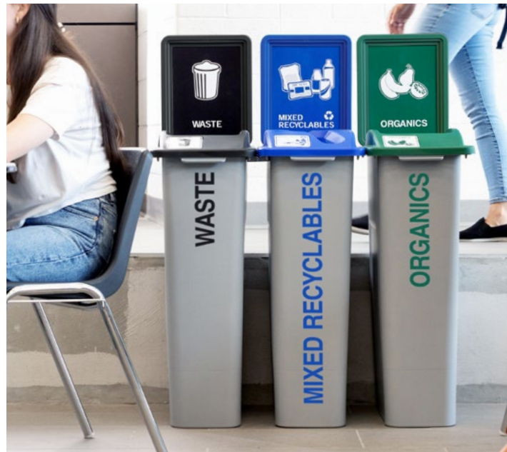
Custom Die-Cut Lettering + Stock Labels & Signs

For over 10 years the Waste Watcher® has been helping thousands of campuses, municipalities, offices, and other organizations achieve their waste diversion goals! This North-American made container prioritizes sustainability, customization, and convenience to meet the needs of our customers.