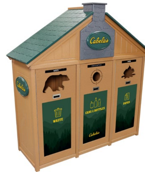
Custom Indoor/Outdoor Triple Container Made from Recycled Plastic Lumber

Busch Systems takes pride in its innovative approach to creating custom recycling and waste containers tailored to the unique needs of our customers. Our team collaborates closely with clients to understand their specific waste management challenges and design solutions that seamlessly integrate into their spaces. Whether it's a sleek and space-saving recycling bin for corporate offices or a robust and weather-resistant waste container for outdoor environments, Busch Systems combines functionality with aesthetic appeal. Our custom creations not only enhance waste disposal efficiency but also reflect our commitment to sustainability and environmental responsibility. With a focus on quality craftsmanship and eco-friendly materials, Busch Systems continues to be a trusted partner in shaping a greener future, one custom container at a time.