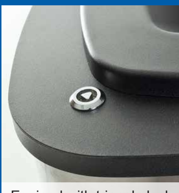
Equiped with triangle lock (Boka Single in photo)