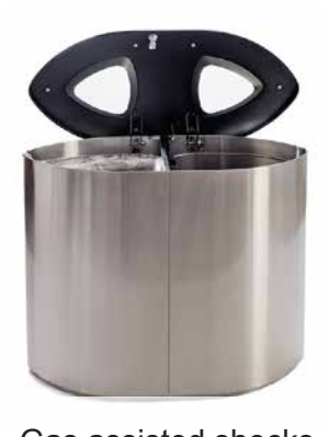
Gas assisted shocks