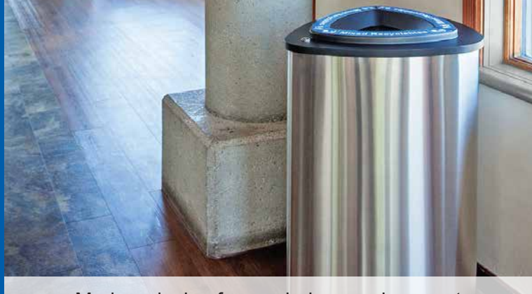
Modern design for any indoor environment