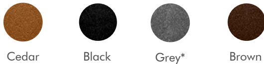
Cedar Black Grey* Brown

*Assembled and ready to ship in small quantities.