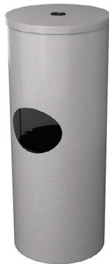
109522 *Includes Hanging Bracket for Larger Rolls of Wipes

Wipes and Waste in one convenient container. The Cleanli™ is designed to complement any space while providing the perfect solution to dispense sanitizing wipes and collect waste. The unit will support the dispensing of hardshell or large roll wipes, with a finish that resists corrosion due to the sanitizing fluid. It's smart, ergonomic design means that the unit is easy to service, with the handle on the waste container always standing up, keeping employees away from contaminated waste.