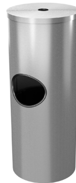
109258 *Includes Hanging Bracket for Larger Rolls of Wipes