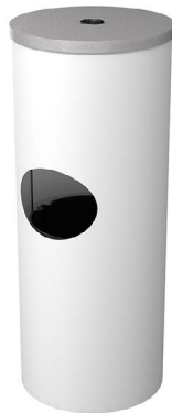
109524 *Includes Hanging Bracket for Larger Rolls of Wipes