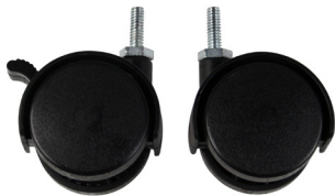
2x Locking Casters 2x Non-Locking Casters