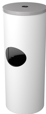
109524 *Includes Hanging Bracket for Larger Rolls of Wipes