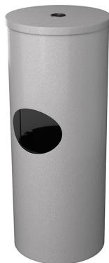
109522 *Includes Hanging Bracket for Larger Rolls of Wipes

Wipes and Waste in one convenient container. The Cleanli™ is designed to complement any space while providing the perfect solution to dispense sanitizing wipes and collect waste. The unit will support the dispensing of hardshell or large roll wipes, with a finish that resists corrosion due to the sanitizing fluid. It's smart, ergonomic design means that the unit is easy to service, with the handle on the waste container always standing up, keeping employees away from contaminated waste.