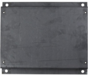
1 x Mounting Bracket