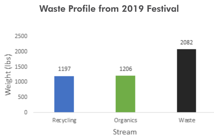
Figure 2: Total amount of waste, recycling and compost generated