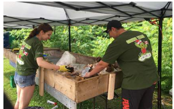
Brantford Canada Day Volunteers conducting a waste audit