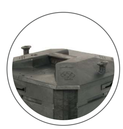
LARGE LOCKING LID HELPS TO KEEP WILDLIFE OUT