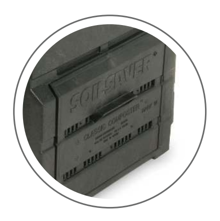
DUAL SLIDE UP DOORS