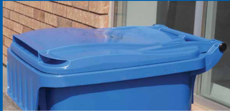
Contoured lid reduces warp and pooling water