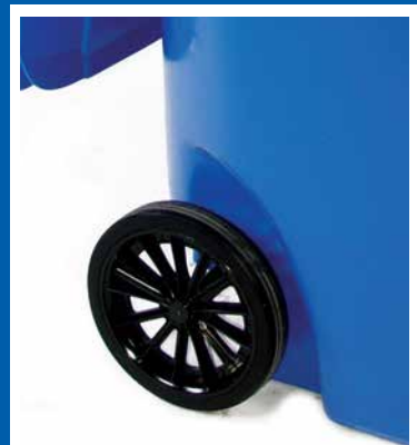
10” rubber wheels