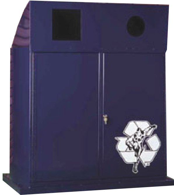
**shown as a double**

The Millennium Outdoor Unit is made from 18 gauge heavy duty galvaneel steel and comes with heavy duty plastic inserts. Front doors open for unloading access. The doors also lock for improved security. Units are fire resistant.