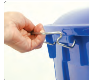
Available side handles