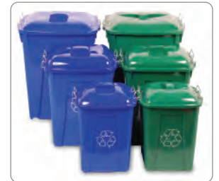
7, 14, 26 gallon sizes